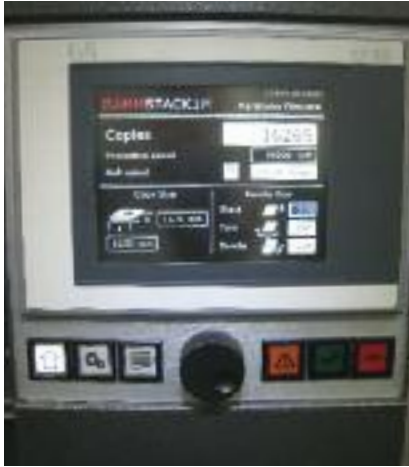
Set-Up Control Panel The GAMMSTACK1M separates the stacker’s operation controls from the machines set-up control

The GAMMSTACK1M separates the stacker’s day-to-day operation controls from the machine’s set-up controls. On/off buttons and clear-out functions needed by stacker operators are conveniently located above the delivery table hood on both sides of the machine. Set-up operations are easily accessed via the large 5.7" LCD control panel. This division of labor makes the GAMMSTACK1M operator friendly and ensures the secure function of set-up controls.