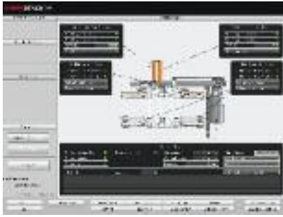
Remote diagnostic ability