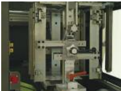
GammStack1M lower stacking chamber